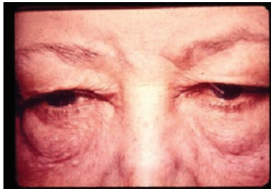
Upper and Lower Eyelid Blepharoplasty Pre-Op

Stasior & Stasior has certified eye plastic surgeons who can answer any and all questions you may have about the quest for younger looking eyes. Call today for a consultation to learn more about how you can prevent future problems and protect your beautiful eyes.